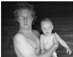
Girls Love Rallie