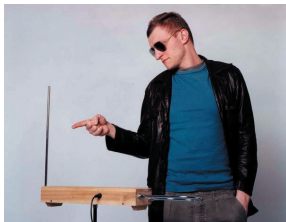
I Like This Wind